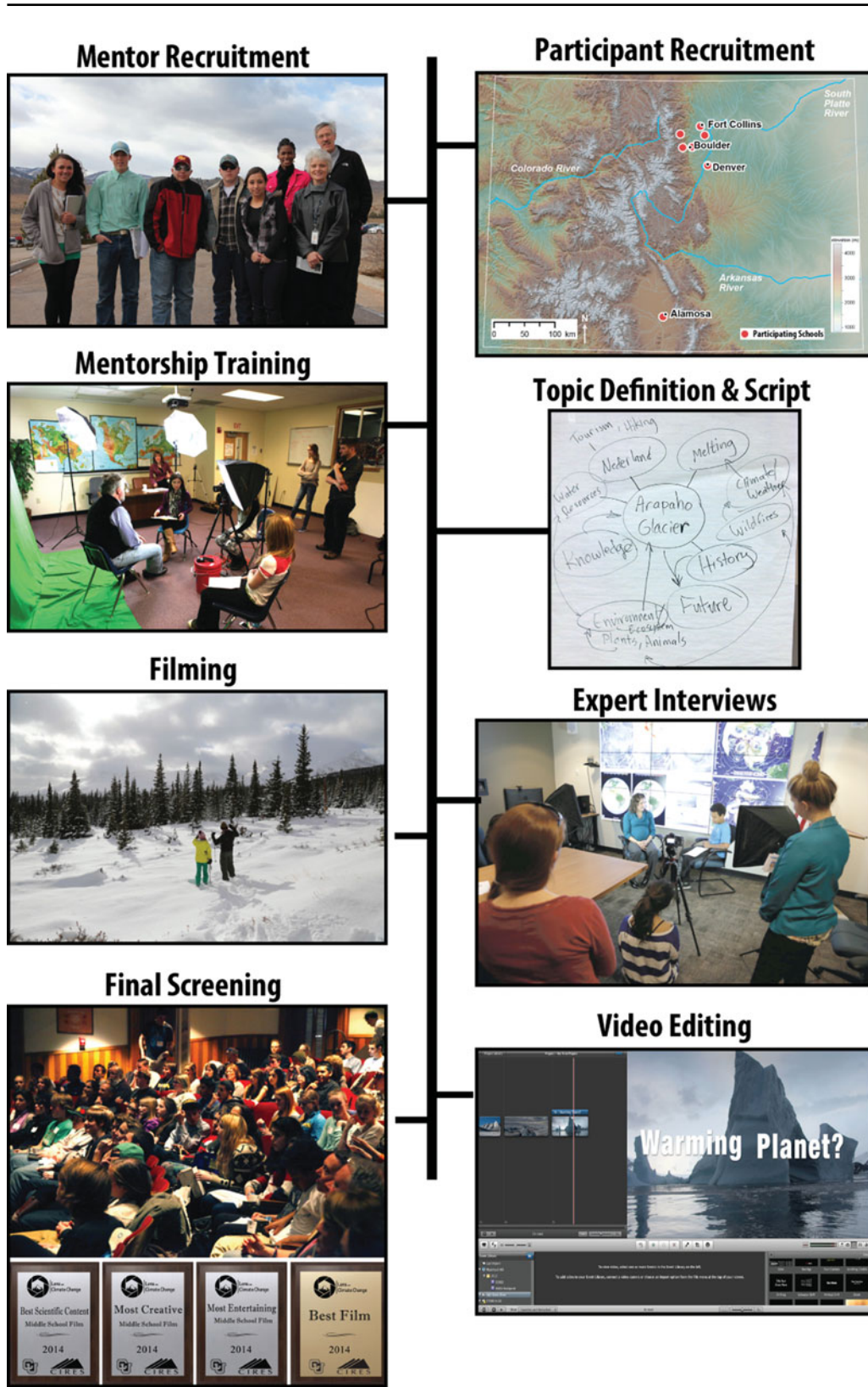
Figure 1. Schematic overview of the Lens on Climate Change program structure. (Color figure available online.)