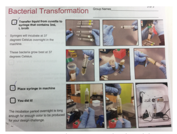
Figure 5: Lab Protocol Checklist