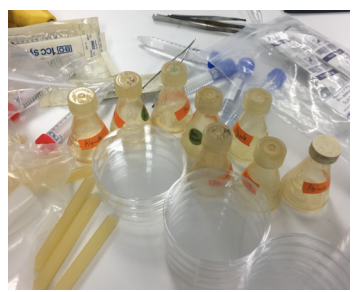
Figure 4: Lab Materials