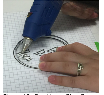
Figure 10. Creating a Glue Gun Outline for Logo

dye rather than chemicals... We've always perceived bacteria as something negative [but] ... for us to use it in a way that would benefit us is interesting." Thus, by contextualizing the design within an existing world problem and providing tools to solve this issue using synthetic biology, students were more interested in learning about the possibilities of biomaking and design.