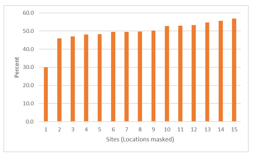
Figure 2. Average math pre-test scores by SEEK site. We are focused on understanding differences between sites for the second objective of the project.