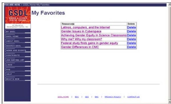
FIGURE. 2 My GSDL.

application to submit a resource to the GSDL, become a reviewer, or make suggestions to collaborate with the GSDL. Resources submitted in this manner are first reviewed by staff and are then reviewed by two experts to ensure the resource aligns with gender-equitable criteria and is accurate in content. Through My GSDL users can log-in to save resources in their own folder or “recipe box.” This feature will be of use to users who do not have time to complete a search in one sitting, who wish to develop their own collection of resources for future use, or who want to share searches and resources with others.