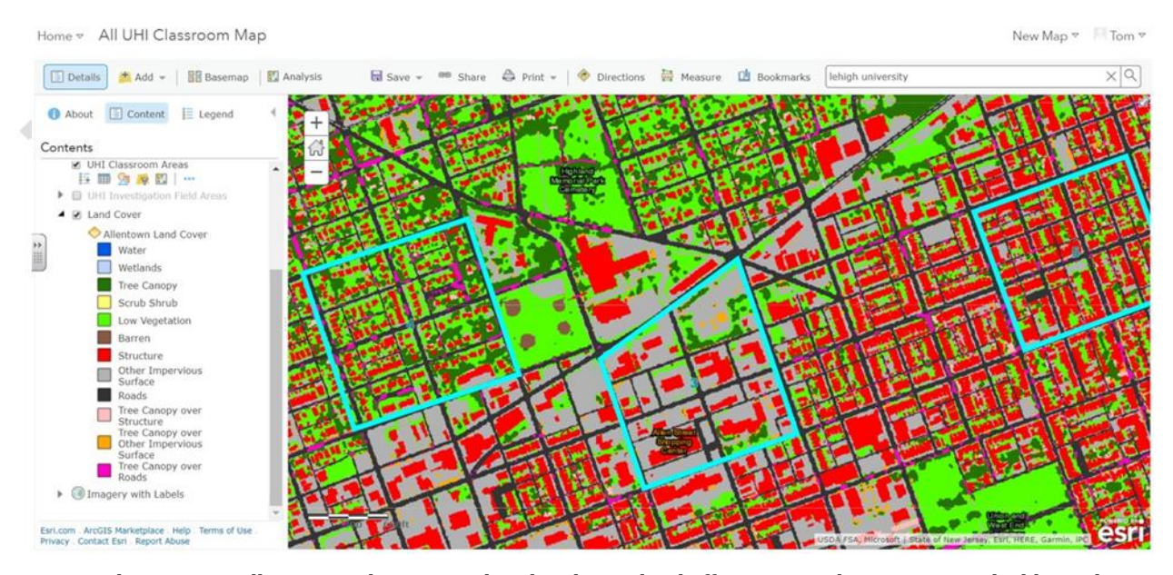
Figure 2. Land cover map allowing students to study urban heat island effects across the entire city. The blue polygons are assigned neighborhoods for student groups to examine a suburban neighborhood (west side of map), a commercial district (center), and a dense residential district (east).

In the next step of the investigation, students analyze a GIS map of the land cover in their city. This map displays both built environment features (structures, roads, impervious surfaces such as parking lots) and natural features that help reduce the urban heat island effect (vegetation and tree canopy, including trees that shade structures and roads). Students then examine an assigned neighborhood in their city (see Figure 2) to analyze the land cover and discuss how it contributes to the urban heat island effect.