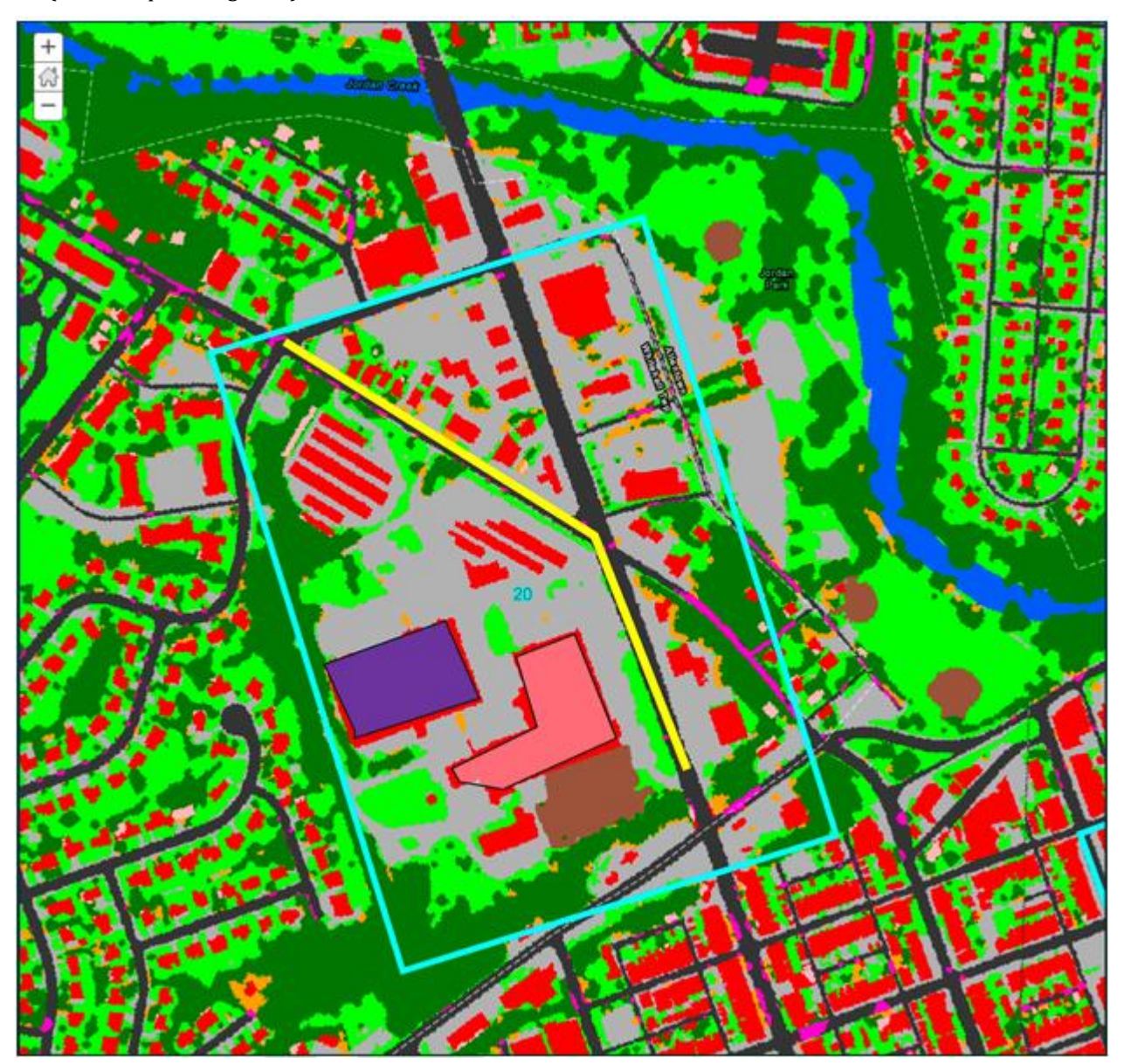
Figure 3. Sample student product from the Urban Heat Island investigation. To reduce the UHI effect in the assigned zone, this student has added a green roof with a garden (purple), white roof instead of a black roof (pink), and changed street to light asphalt (yellow).

After discussing the existing land cover and possible mitigation strategies, students propose several changes for their assigned neighborhood. For example, students suggested converting dark rooftops to light-colored rooftops, creating shade by adding rows of trees within parking lots, modifying large commercial structures to incorporate green roofs, and other recommendations that increase reflection and decrease solar energy absorption by a surface. Students then use the suite of draw tools to make these changes on their ArcGIS.com map and submit their recommendation to their teacher (see example in Figure 3).