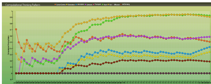
Figure 3. The Computational Thinking Pattern Analysis Forensics graph explains how a student has progressed his/her