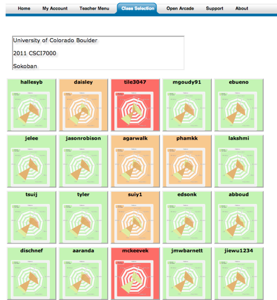
Figure 4. Example REACT Assessment Dashboard showing every student's performance in a given classroom.

The Assessment Dashboard indicates to teachers where students are in their programming tasks. The dashboard visualizes the programming progression for each student in the class through CTPA [4]. In Figure 4, green indicates students who are completing the program correctly, orange indicates students who may need some help with their program, and red indicates students who are in significant need of scaffolding. The Dashboard clearly shows students that might be in trouble. By selecting a specific student in the Dashboard, a teacher can see in-depth representations of that student's progression in their Computational Thinking Pattern Analysis Graph [4] and Computational Thinking Pattern Analysis Forensics.