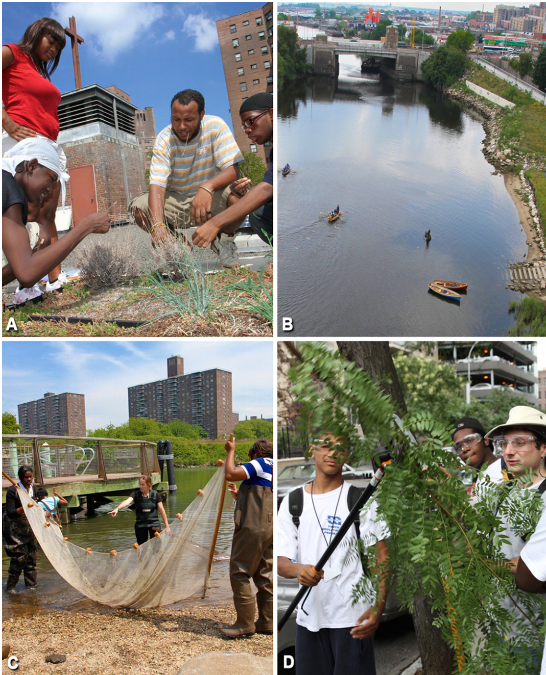
Fig. 2. Examples of urban environmental education activities in the Bronx, New York City, summer 2010: (A) Environmental stewardship on a green roof, Youth Ministries for Peace and Justice, (B) Recreation on the Bronx River, Rocking the Boat, (C) Biodiversity monitoring by students from Satellite Academy High School, (D) Tree pruning workshop conducted by Trees New York for students at Mosholu Preservation Corporation.