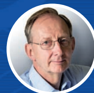
SIR JOHN B. PENDRY

Max Planck Institute for Biophysical Chemistry, Germany