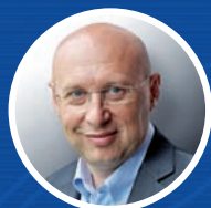
STEFAN W. HELL

Max Planck Institute for Biophysical Chemistry, Germany