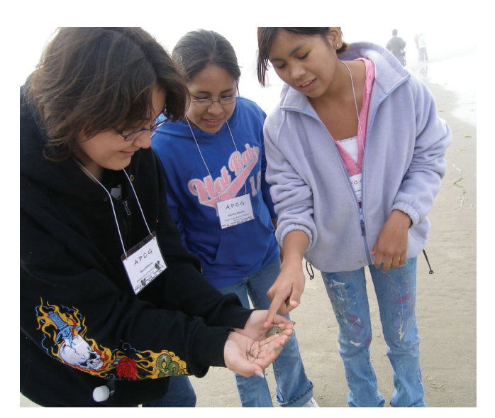
"Our strategy is to involve young people in entrepreneurship activities that have value to the local community..." ITEST PI

A separate question on the MIS asked projects to check off the types of institutional partners with whom they worked (see box). Despite the large numbers of projects that involve a range of institutional partners within the ITEST program, only 11 projects (19%) specifically mentioned using partnerships in order to engage participants from underrepresented groups. Of these 11, some forged relationships with groups that had well-established connections to underrepresented youth, including community and not-for-profit organizations, such as the Girl Scouts. Some projects, particularly those that worked with Native Americans, Alaskan Natives, or