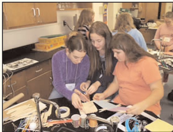
ESTEEM girls collaborate to create a product of the future.

From Marcia Kropf’s perspective, “Girls today [are] facing a lot of stereotypes that girls have faced for a long time — girls are expected to speak softly and not cause trouble, and smarter girls are not popular.”