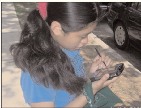
Technology at the Crossroads student at work

Highlights of the September 2005 Webcast