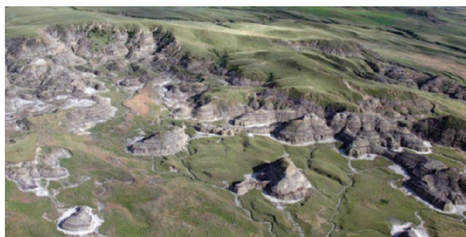
Aerial view of Fort Peck.

This approach, combining geospatial technology and paleontology to engage middle school teachers and students in a rural field setting, presents a unique model of education. It has the potential to motivate future generations of learners and to steer them toward careers in technology and science. As we begin our second year, readers are invited to gain further information by visiting our Web site for the Paleo Exploration Project: http://pep.explore-ed.com .