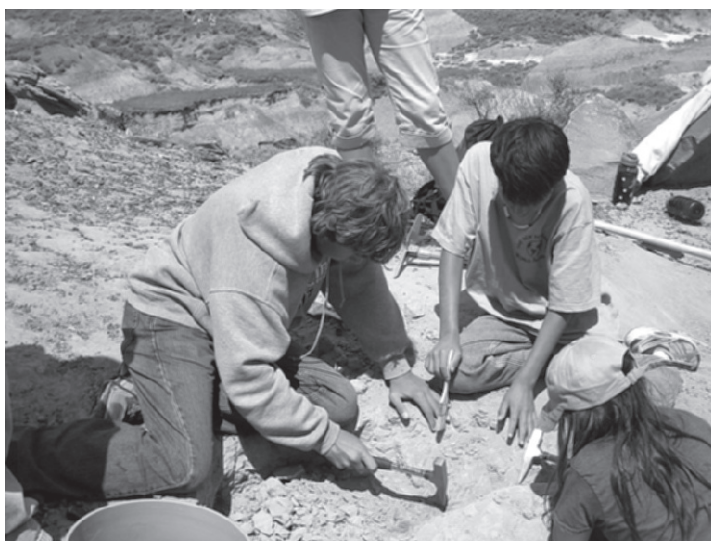
Students investigate a site.

The PEP funded a series of weekend training workshops for the teachers, held in the Glasgow School District and on the University of Montana campus. Teachers selected to participate in the PEP program had the option to register for university credit at the graduate level. Both teachers and middle school students took part in summer classroom and field experiences near Fort Peck, Montana. During the workshops, teachers were introduced to simple, intuitive geospatial technologies such as Google™ Earth and global positioning systems (GPS). Later, they were introduced